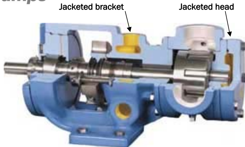
STANDARD-JACKETED PUMP WITH JACKETING ON BRACKET AND HEAD